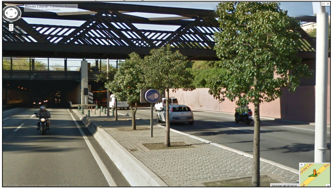
a) View from the roadway during off peak time:

Figure S2: High TRAP exposure site set up: Pedestrian Bridge above main city ring roadway "Ronda Litoral" in Barcelona